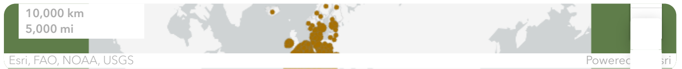
Youth unemployment, in thousands